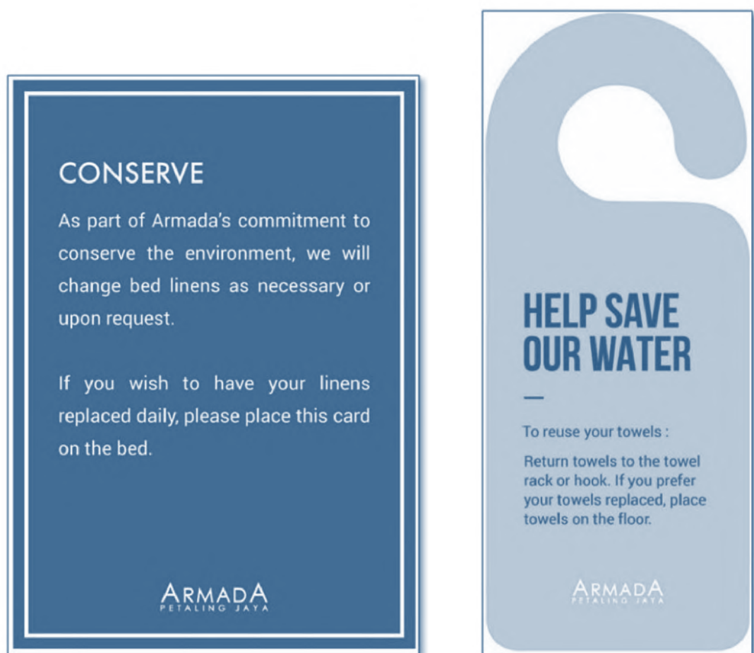
Figure 1: Sample signages

Since July 2017, we placed little signs in all our hotel rooms to encourage and give guests the option of reusing their towels and bed sheets (please refer to Figure 1). Guests can choose not to have their rooms serviced each day which reduces the amount of water, energy, and chemicals used by the hotel.